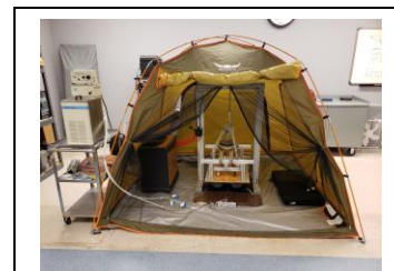
Figure 2. Cushion heat and water vapor test

The test for heat and water vapor transmission properties of wheelchair cushions under simulated loading conditions is shown in Figure 2 [12]. The testing environment of 23±2°C and 50%±5% relative humidity (RH) was maintained with environmental controls using an external humidifier in the tent. The water circulator was also maintained between 35°C and 37°C, and 200 ml of distilled water was added in a thermodynamic rigid cushion loading indenter (TRCLI). The data recording began with temperature and humidity readings from the sensors at a 0.2 Hz sample rate. At steady state, the TRCLI was applied onto the